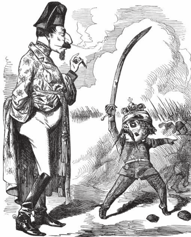
THE GIANT AND THE DWARF.

A British cartoon published on 11 June 1859. Napoleon III is saying to Victor Emmanuel, 'Bravo, my little fellow! You shall do all the fighting, and we'll divide the glory!'